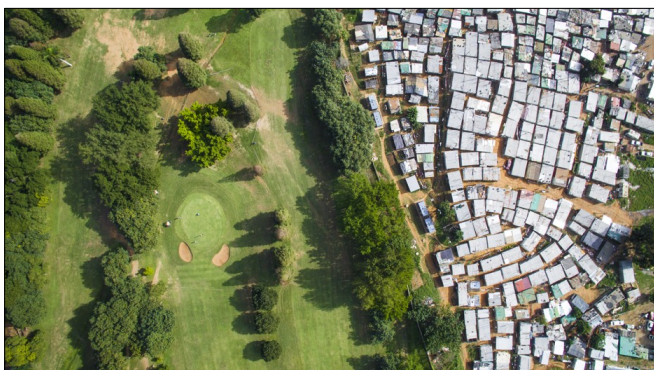
golf course next to a slum in Johannesburg